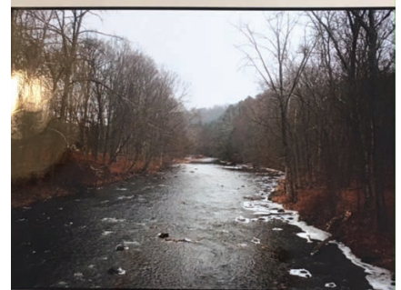
Portrait of a New England Town