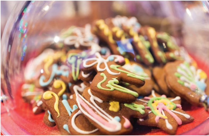
St. John's Christmas Bazaar, Saturday December 1