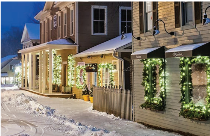
New Preston Winter Walk, Saturday December 8