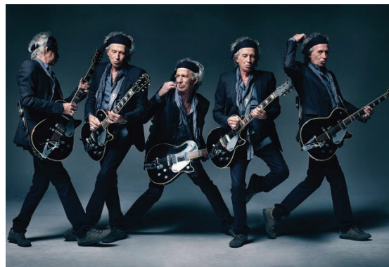
Keith Richards, New York, NY, 2011