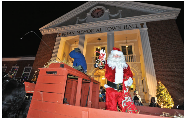
Holiday in the Depot, Friday December 14