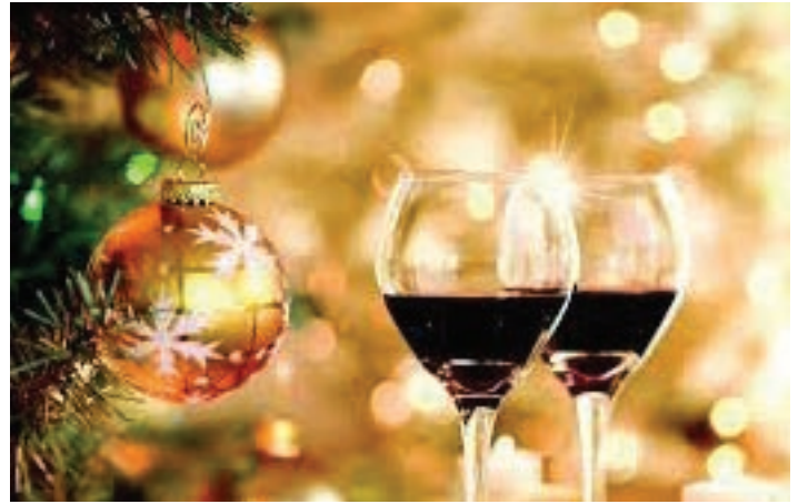
Festival of Trees, Gunn Memorial Library, Friday December 7