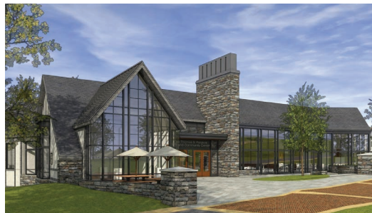
The Thomas S. Perakos Arts and Community Center Will Open at The Gunnery January 2020

on Saturday as part of the FREE OuterFest. With the Congregational Church as their stage, the newly minted young jazz performers will share their music with the community.