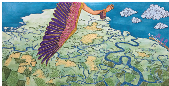
Kaineri Seeking, Lelia Daw, Burmese shwe chi doe tapestry, 28 x 59 inches

Bird populations have shrunk by over three billion since 1970, a decrease of over 30% in 50 years. This decline affects all birds, not just those that are considered endangered. The causes are widespread, including climate change, deforestation, agricultural pesticides, and the encroachment of human development on nesting and migratory space.