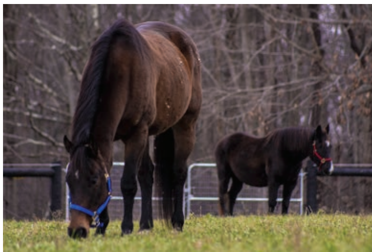
New residents of the Agriscience Academy of Shepaug Valley School, Gulliver and Morgan.