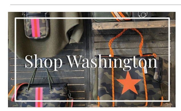
We look forward to seeing our friends and neighbors this holiday season.

Region 12 Schools want to thank the town of Washington and its community members for allowing our students to grow and thrive. The success of last year's school year is due to your care and consideration of health and safety practices. Our community is the heart of our schools!