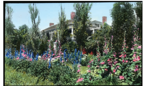
Vaillant Garden at 24 Old North Road in Washington in 1920

June 13 @ 10am- Washington History Club in the Morning: "Washington Gardens and Gardeners, Past & Present" - Discussion group in person at the Washington Senior Center.