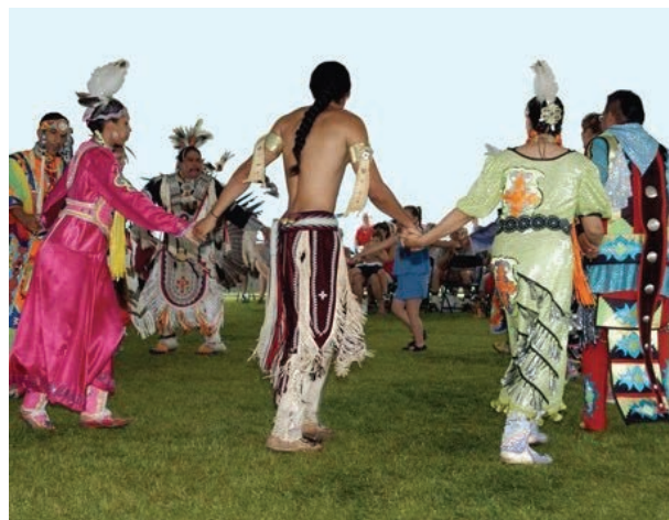
Southern New England Native Americans dancing a traditional friendship dance at a Green Corn Festival and Dance hosted by the Mashantucket Pequot tribe in 2007.

January 16 at 6:30pm via Zoom - Connecticut's Indigenous Communities: An Introduction to their Histories and Cultures. This presentation provides a window into tribal history and culture before and after European settlement, including that of the Weantinock and Pootatuck peoples in whose ancient homelands the town of Washington now resides.