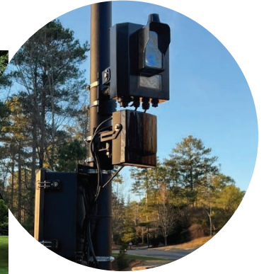
Automatic traffic safety device

the time of this publication, the devices will soon be up and running on our Town roads. We're currently going through the very comprehensive process of obtaining needed permits and state DOT approvals. The Board of Selectmen, as the local traffic authority, and our police have been in ongoing training on the use of these devices.