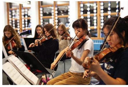
Participants at one of the ASAP! Youth Ensemble sessions.

Registration is now open for ASAP!'s Youth Ensemble, an enriching and innovative music experience for students in Litchfield County. This year's program includes an inspiring field trip to NYC Pops at Carnegie Hall, in addition to multiple concerts for the public. Sessions will take place at Schaghticoke Middle School and the Silo at Hunt Hill Farm. Register at asapct.org.